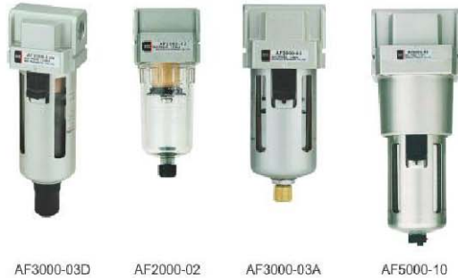
AF3000-03D AF2000-02 AF3000-03A AF5000-10